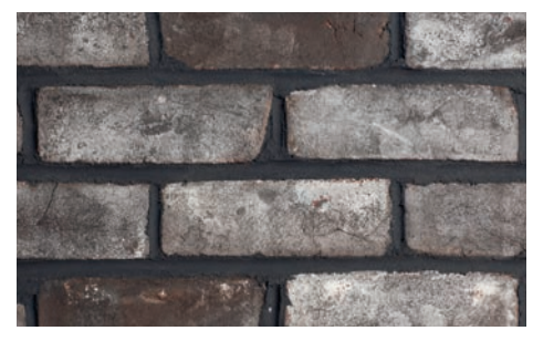
Woodsmoked (white mortar)