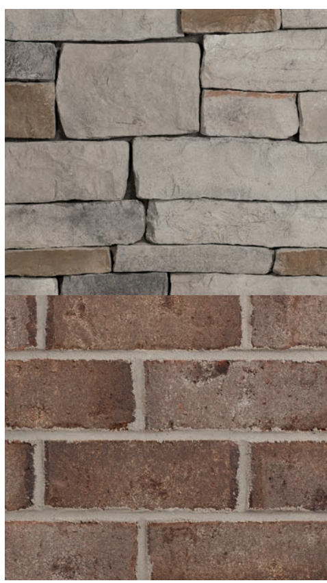
Contrasting | San Moritz Glen Ridge with Grey Ash

Focal points, like gables, columns and entryways, are perfect opportunities to add mixed materials to your exterior. Most of these features create natural stopping points that allow the brick and stone to seamlessly flow together.