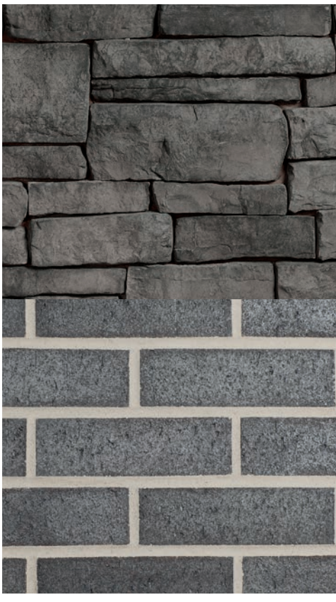
Complementary | Black Glen Ridge with Ebonite Veloui